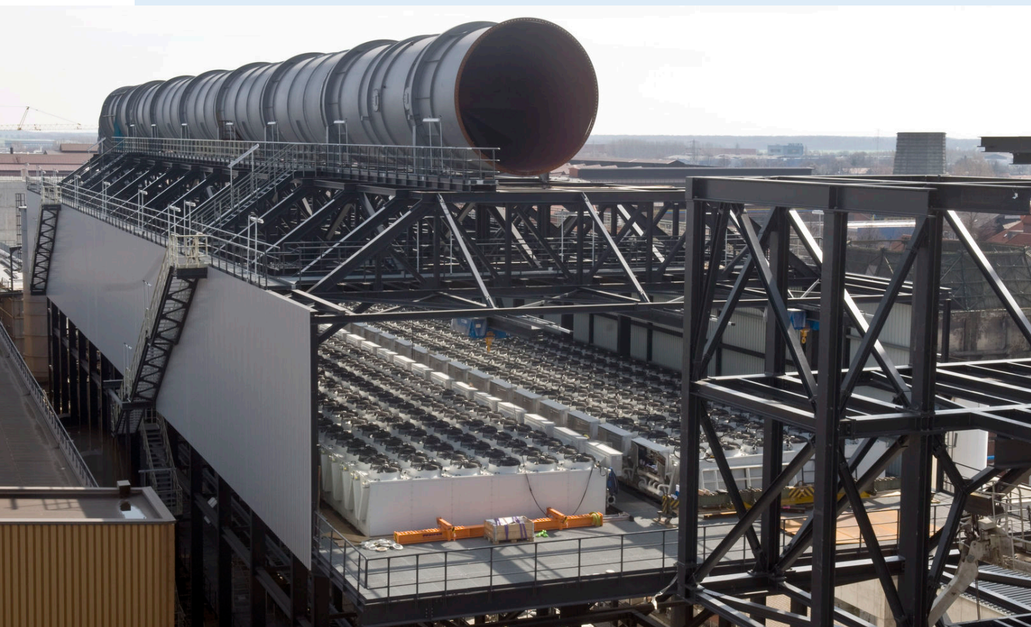
Güntner delivered a total of 64 drycoolers for this installation.

64 drainable GFW drycoolers with hinged fans and built-on GWS switch cabinets provide for smooth operations.